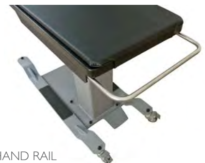
HAND RAIL Move your table with ease

The New Oakworks® CFPMFXH Fixed Height C-Arm Imaging Table incorporates Oakworks brand reputation for high quality and reliability into this cost effective table designed to accommodate mobile and ceiling suspended C-Arm systems. The CFPMFXH is offered in a standard height of 37" with custom height options available in one inch increments from 31" to 36". This mobile c-arm imaging table has a 500lbs patient weight capacity and provides all of the basic features required for successful pain management image-guided procedures. The integrated head rest carbon fiber top features a 56"(142cm) metal free imaging area for maximum C-Arm efficiency. The table is mounted on a low profile base and can be moved easily from room to room and secured with 4 locking casters. Included with every table are a 1" radiolucent table top pad (2" pad is optional), 1 crescent face rest pad, and 2 supine cranial pads. See page 1 for pad descriptions.